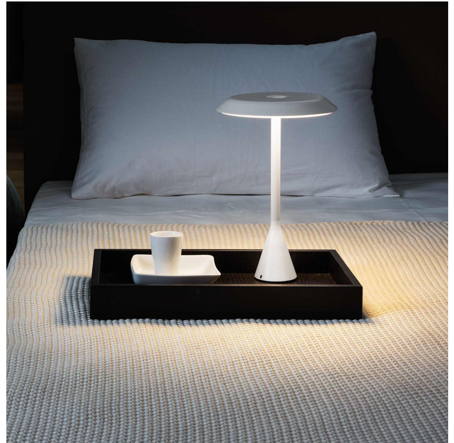
Table lamp with LED sources for a widespread lighting, suitable for domestic and working places. Aluminium structure, polycarbonate diffuser with anti-glare treatment. Available in two versions: Panama and Panama Mini, white or black. Mini available also in the cordless portable rechargeable version. Duration: 10 hours battery life, recharge: 6 hours.